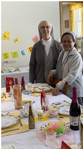
A couple pictures celebrating Easter 2023