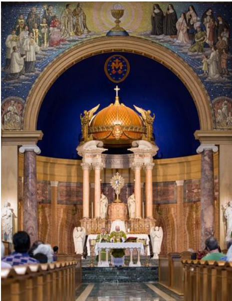
Our Lady of the Blessed Sacrament Chapel