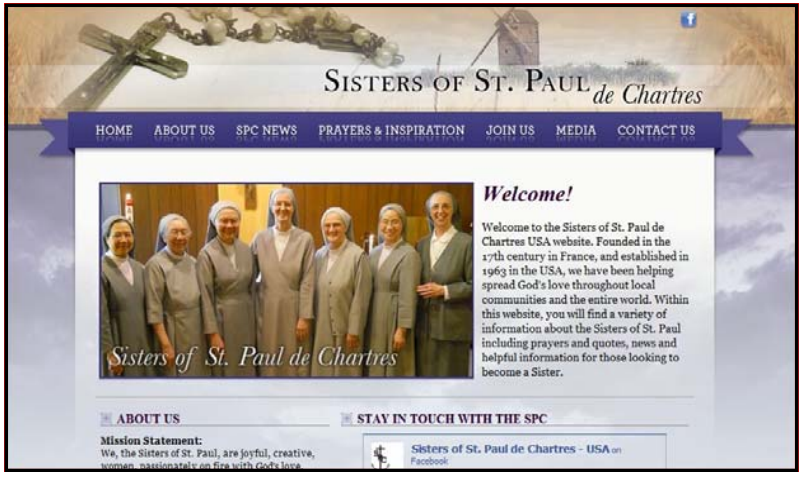
Also check out our Facebook and see what we have added if you haven't already done so at: facebook/sistersofstpaulusa and "like" us.

We are proud to announce that our website has a new look. Please check it out at : SistersOfStPaulUSA.org.